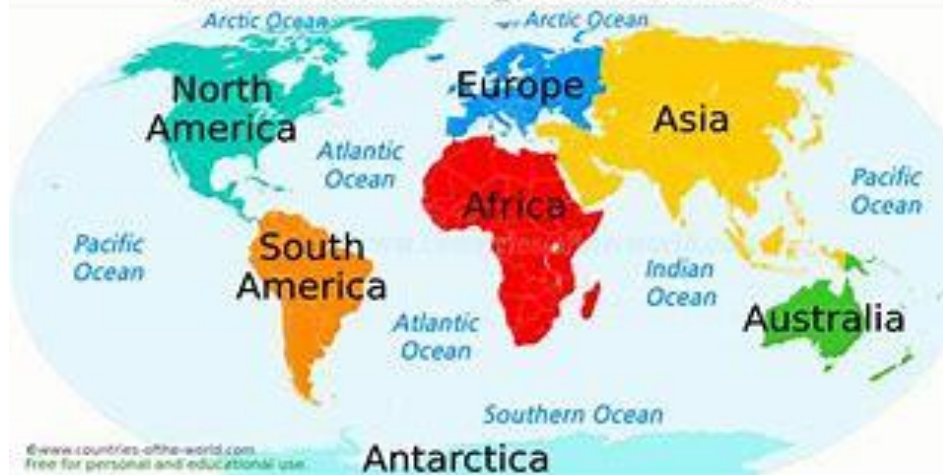
7 continents map with 5 oceans